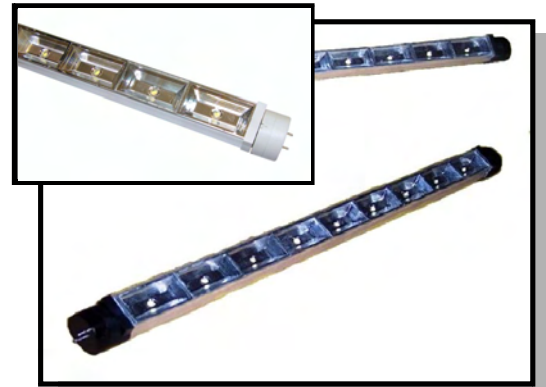
T12 Linear Lamp Tube